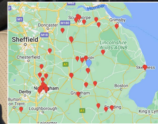
Call-outs responded to by the LNAA crew on board the helicopter and critical care cars

Our crew have responded to nearly 400 missions in the first three months of 2023. One busy spell in February, we were called to 43 incidents including road traffic collisions (RTC), cardiac arrests, falls and equestrian injuries - all in the space of nine days.